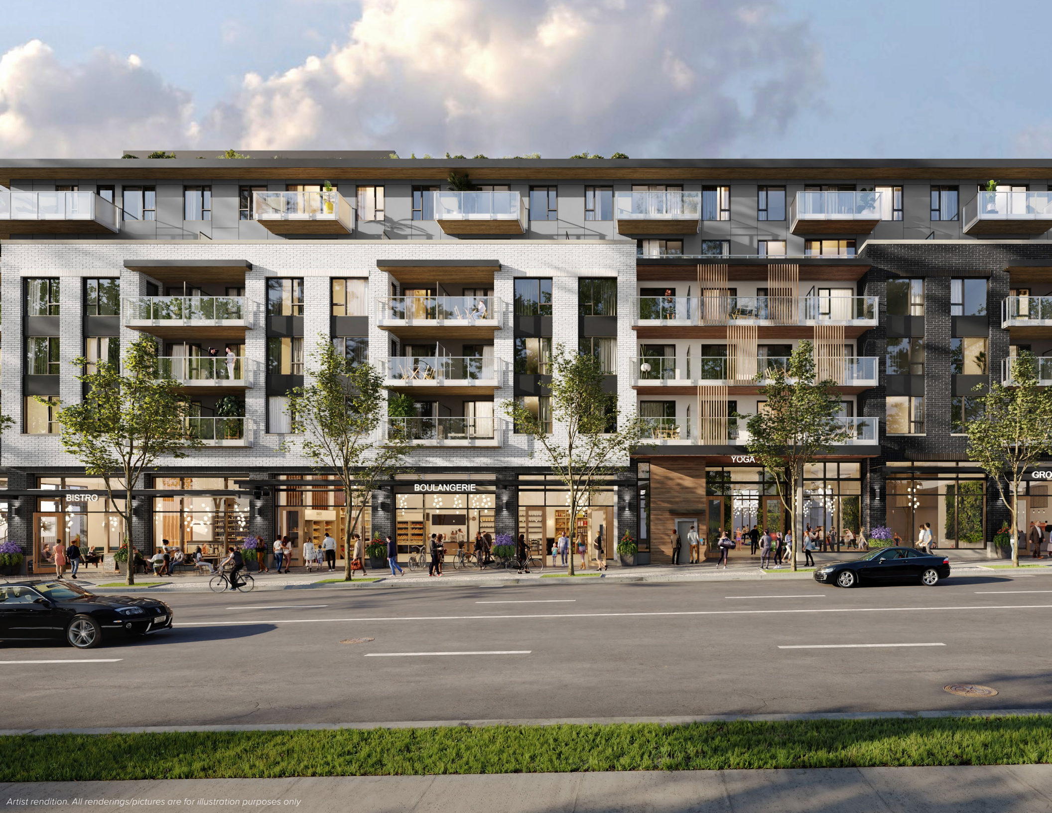
Artist rendition. All renderings/pictures are for illustration purposes only