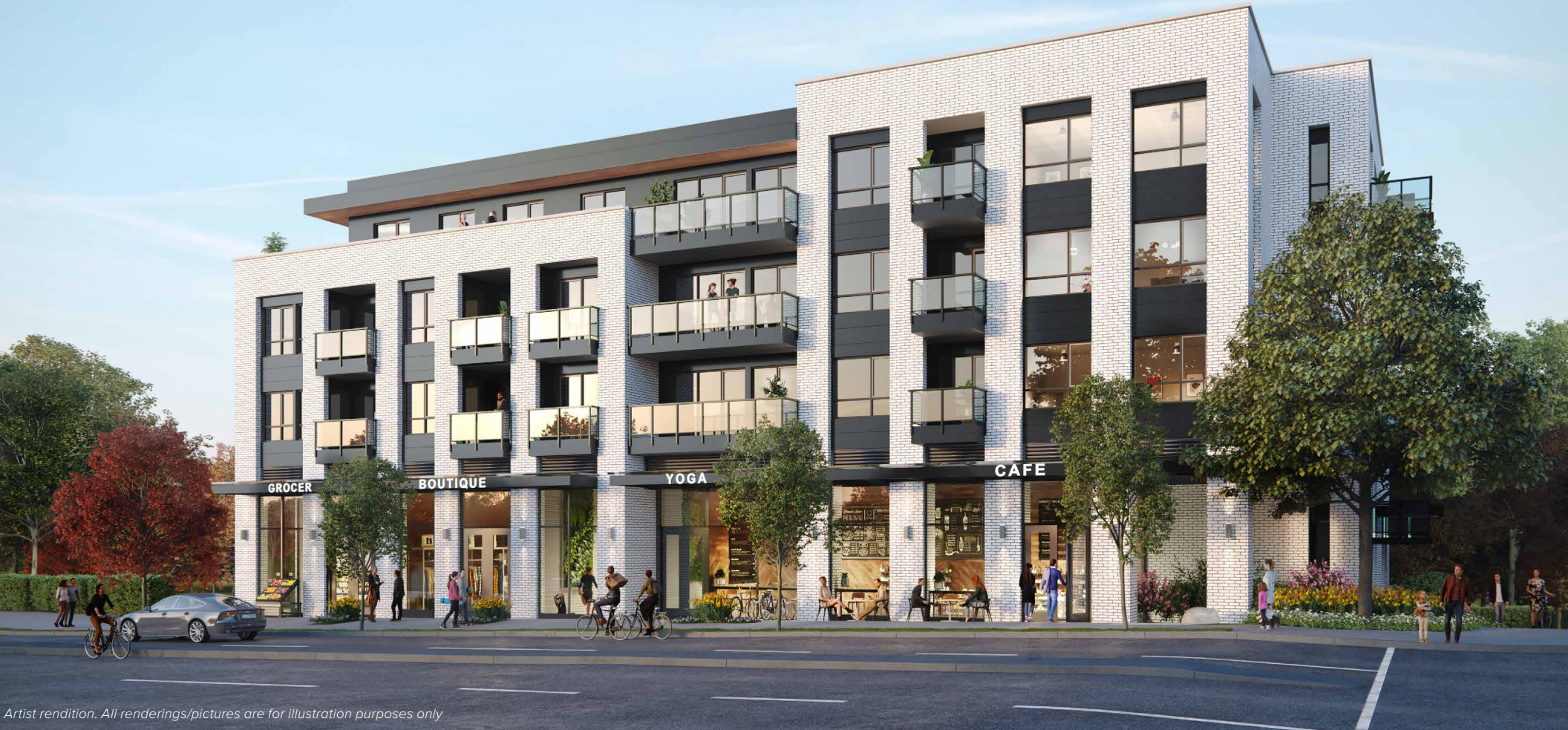
Artist rendition. All renderings/pictures are for illustration purposes only