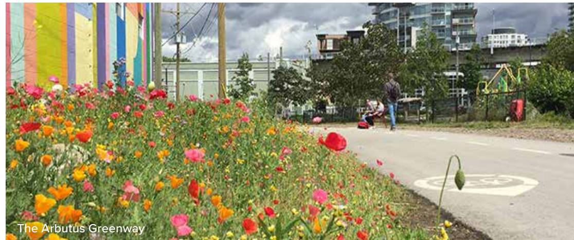
The Arbutus Greenway