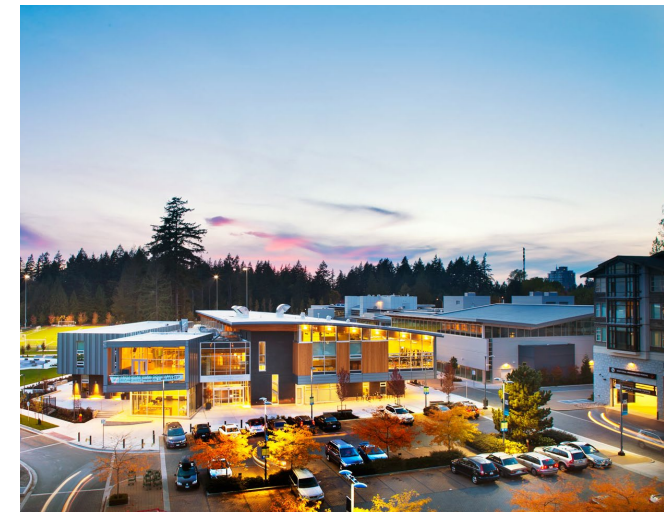
Wesbrook Village is home to the Wesbrook Community Centre and the University Hill Secondary School

For more information about the Wesbrook Community, visit www.discoverwesbrook.com