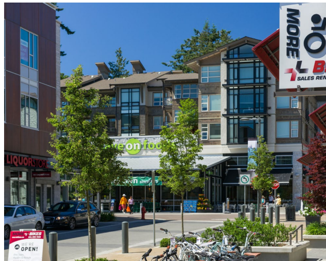
Save-On-Foods, BC Liquor Store, & More Bikes