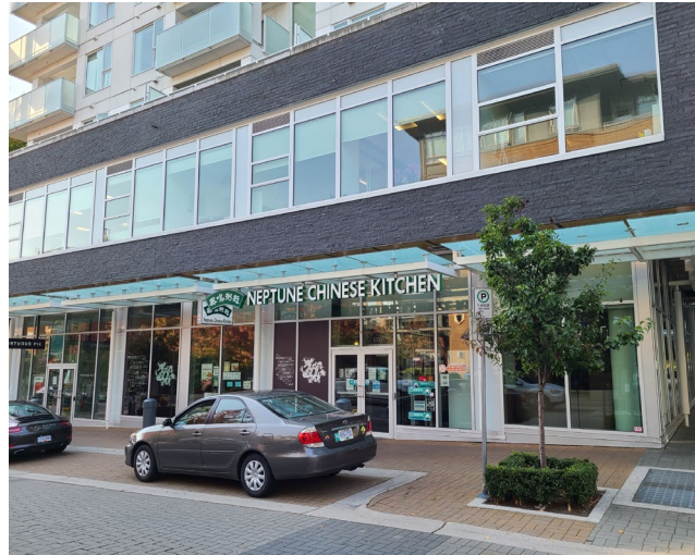
Neptune Chinese Kitchen