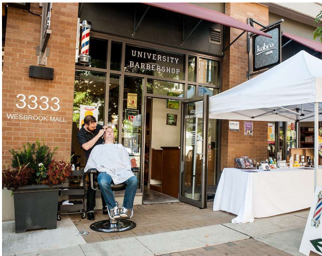
University Barbershop & Kabro Salon