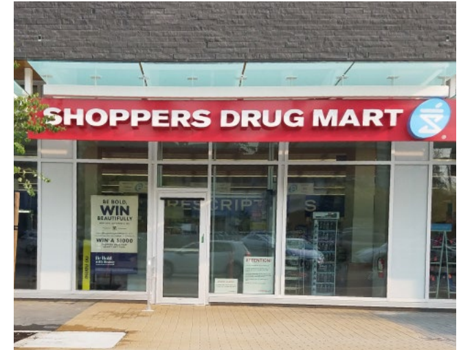
Shoppers Drug Mart