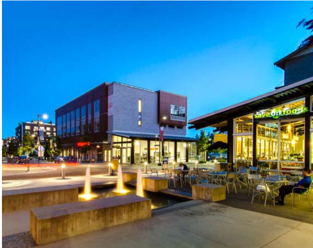
Wesbrook Village North Entrance